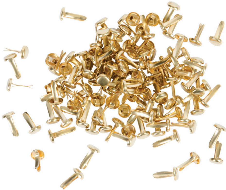
Detail Product Image