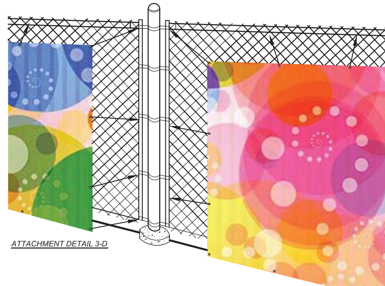
ATTACHMENT DETAIL 3-D

FENCESCREEN PANELS WITH 2" FOLDED AND WELDED EDGES FOR REINFORCEMENT. ATTACH TO FENCE WITH FENCESCREEN ATTACHMENT TIES OR GALV. HOG RINGS.