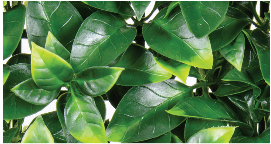
FRONT - REALLEAF® MAT CLOSEUP