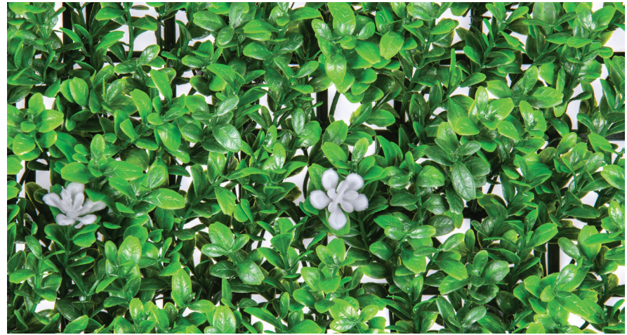
FRONT - REALLEAF® MAT CLOSEUP