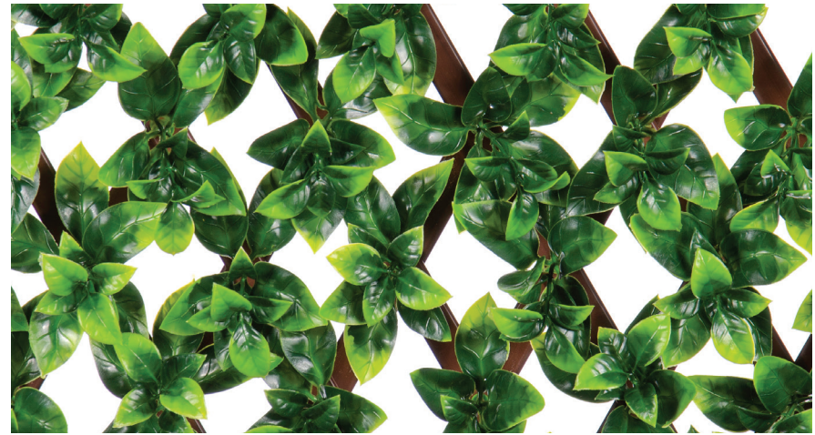
MATERIAL CLOSE UP - FRONT - LDPE REAL LEAF® 3D FOLIAGE