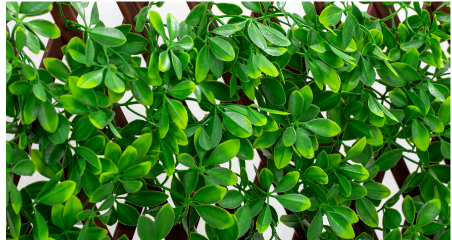
MATERIAL CLOSE UP - FRONT - LDPE REAL LEAF® 3D FOLIAGE