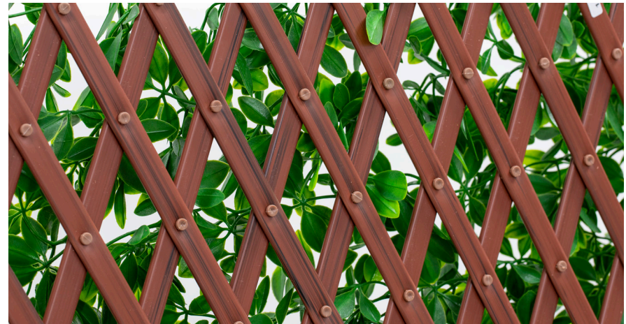
MATERIAL CLOSE UP - BACK - TRUTECH® PVC FRAME