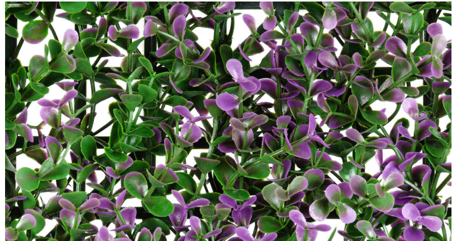
FRONT - REALLEAF® MAT CLOSEUP