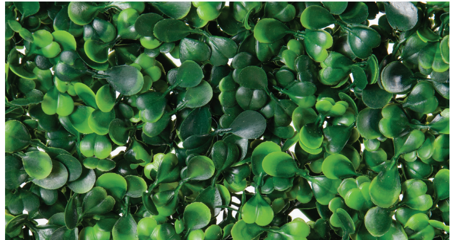
FRONT - REALLEAF® MAT CLOSEUP